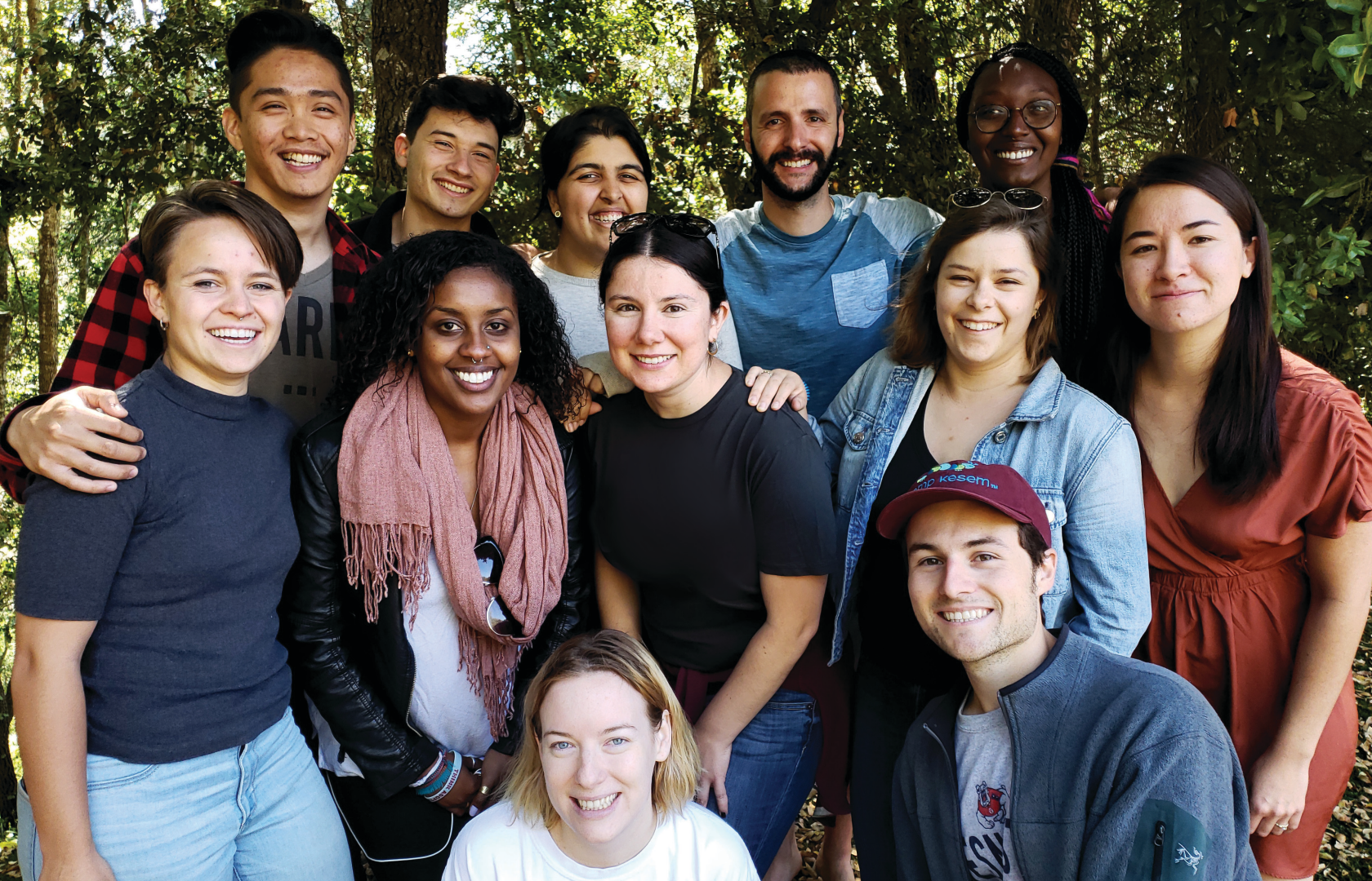
Above: Fellows Program in Public Affairs, Class of 2018.