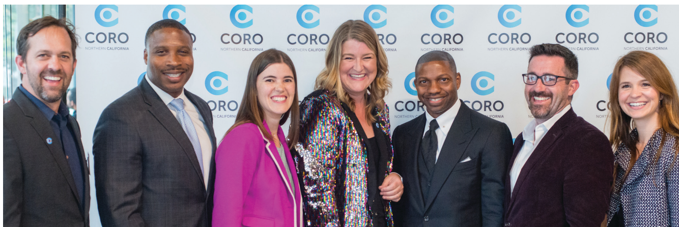
Above: Coro alumni, staff, and board members at our 75th Anniversary Celebration.

In 2017-18, 498 participants engaged in 16 Coro leadership programs and seminars. 96% of our grads reported increased leadership skills.